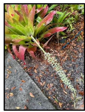
xAndroaechmea 'Cyclops' (Cala