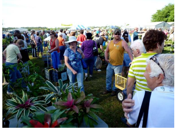
Past Master Gardeners sales at the Volusia County Fairgrounds have always been a lot of fun!