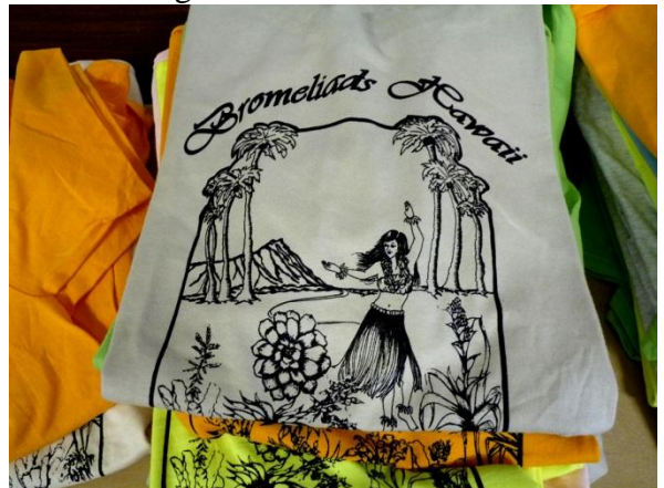
Like the looks of this T shirt? There will be many just like it at the BSI World Conference. It's not too late to register now!

September 8-14, 2014 – BSI World Conference. Ala Moana Hotel. 410 Atkinson Drive. Honolulu, Hawaii 96814. Go to www.bsi.org for the latest information.