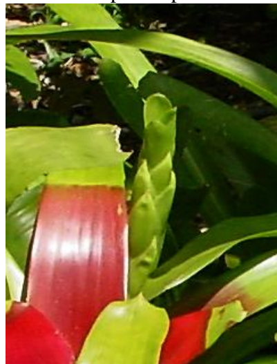
Neoregelia compacta offset.

First described in 1939 by Lyman Smith, Neo. compacta is a medium sized (leaves typically less than 10” long), green leaved bromeliad that flushes an intense red in its center leaves at maturity. Offsets resembling tightly rolled cigars are on the ends of stolons that can reach out well clear of the parent plant.