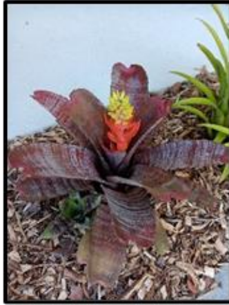
Aechmea nudicaulis (Marinus Grootenboer)