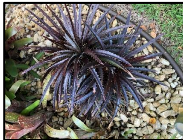
Dyckia 'Cherry Coke'