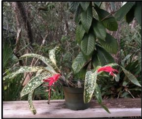
Billbergia 'White Cloud'