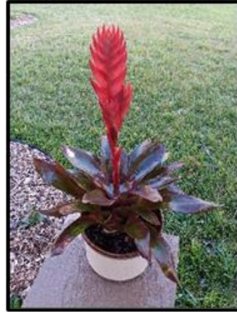
Vriesea (Marinus Grootenboer)