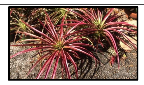
Neophytum 'Galactic Warrior' is now x Sincoregelia 'Galactic Warrior'