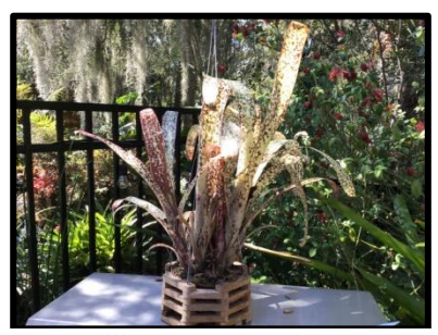
Billbergia 'Casa Blanca'

This cultivar has 2" wide tubular broad leaves to about 17 inches tall. When mature, the ivory base has green marbling throughout with an overall pink wash.