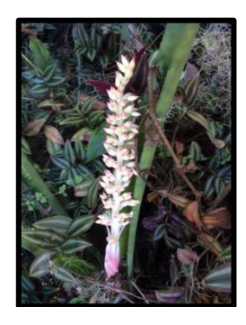
xAndrolaechmea 'O'Rourke' Bigeneric: Androlepsis skinneri x? Aechmea distichantha

This is a stunning landscape plant that can tolerate sun.