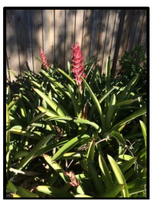
Aechmea distachantha is a very spiny plant with a beautiful bloom.