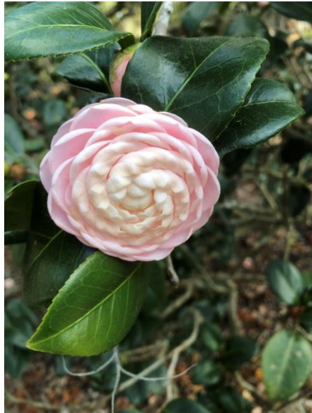
Leu Gardens is known for its camelia collection. This spiral flower was noted during a recent visit.