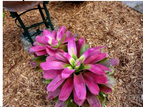
...Neoregelia 'Passion' in bloom is a real eye-catcher!

At this meeting we heard the latest details from the Bromeliad Society of Central Fl. on the upcoming Extravaganza in Sept. as well as the BSI World Conference next year in Sarasota – hosted by the Sarasota Bromeliad Society.