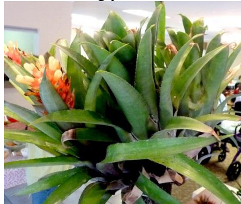
Aechmea pimento-velosoi at last month's show and tell

Show and Tell is always an interesting feature at our meetings and last month's was no exception. Stanley had brought in a very large clump of Aechmeas in bloom, but had lost the name tag. I came up with a possible name for it, but I was wrong. The correct name should likely have been the Brazilian species Aechmea pimento-velosoi, so if you had taken notes at the time please correct them accordingly.