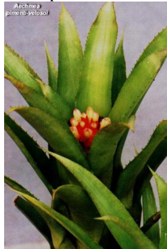
Photo of Aechmea pimento-velosoi from the Florida Council of Bromeliads website (FCBS.org).

This Month's Meeting: Tips, Tricks, and Sleight of Hand.