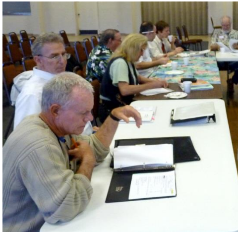
Student judges studying at a judges school in this photo from past years.