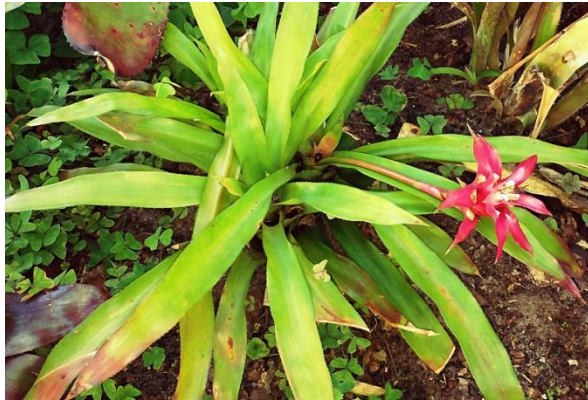
Canistropsis billbergioides – with a beautiful and long-lasting inflorescence.