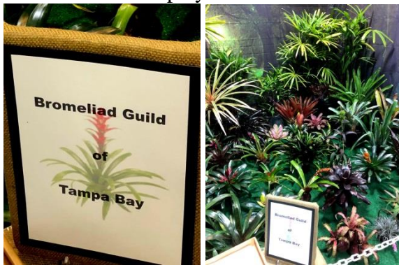
Bromeliad display at the State Fair in Tampa.

Crowds only got larger throughout the day at the Fair! We'd never been to one before and this was mind boggling in many ways with crowds so dense it was difficult moving around, more varieties of food for sale than I even thought possible (deep fried sticks of butter anyone?...or is that even food?), and BROMELIADS. We had heard that the Bromeliad Guild of Tampa Bay had a booth there and this was an opportunity to visit and look over their display and sales area.