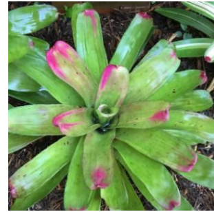
Neoregelia 'Comet'