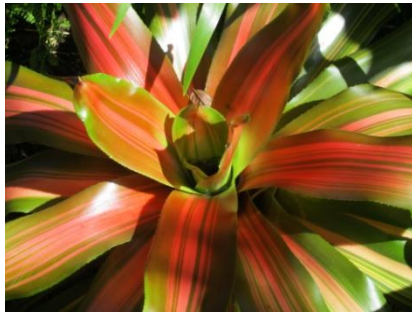
Neoregelia 'Orange Crush'