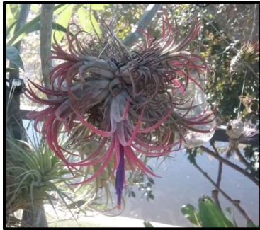
Tillandsia ionantha