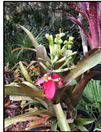
Billbergia 'Violet'