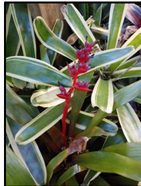
Aechmea weilbachii f. leodiensis