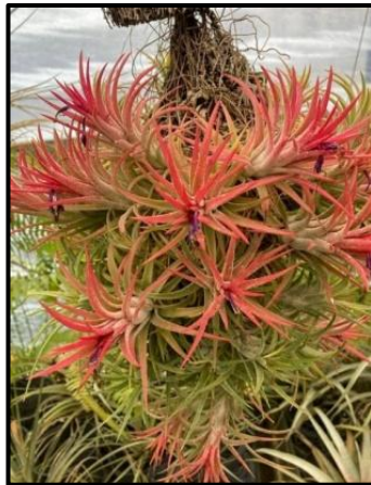
Tillandsia "Wait N See"