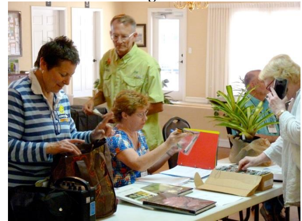
It's typically a busy head table before the meeting gets underway!

BSI recently announced the date and location for the next Bromeliad World Conference and so, we thought that it would be appropriate to show photos from the 2016 World Conference that was held in San Diego, California to give our members a taste of what world conferences are all about. The PowerPoint presentation showed what to expect from one of these events – the banquet, the seminars, the judges school, the judged bromeliad show, tours of nearby gardens, not to mention the people from all over the world and, of course – the bromeliads! As the name implies, BSI World Conferences have been held in many far-