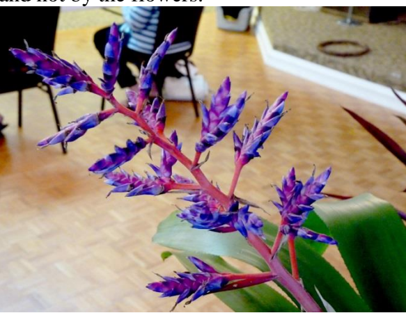
Inflorescence of Aechmea Blue Tango . Picture below is a close-up showing the flower bud and the bracts retaining their color beneath a spent blossom.

Bill had also brought in a beautiful Aechmea Blue Tango . The bloom on this plant is instantly recognizable by its eyecatching and long-lasting inflorescence. What many don't realize is that this 'electric blue' color is provided by the floral bracts and not by the flowers.