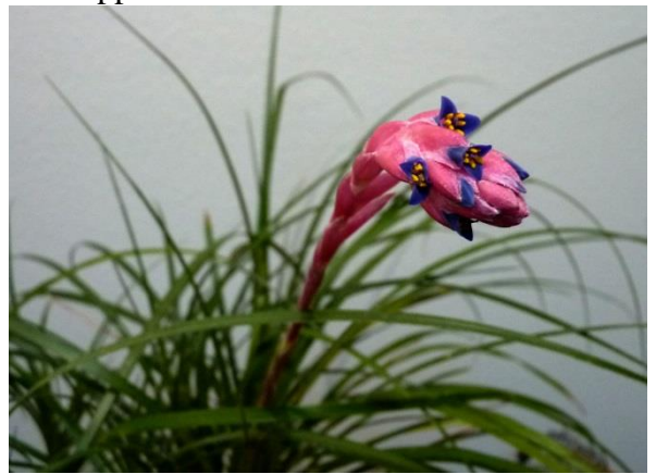
Fernseea bocainensis bloom.

around. Only then do the actual flowers make their appearance.