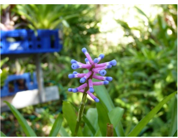
What is it? Aechmea gamosepala, with its distinctive "crossed matchstick head" is usually in bloom in our area from December until February.

According to the BSI Cultivar Registry, Quesnelia 'Tim Plowman' was registered as a cultivar in 1983 following collection of this plant in the wild by D. Sucre in Rio de Janeiro. The plant was given an identification number of "Plowman 12968".