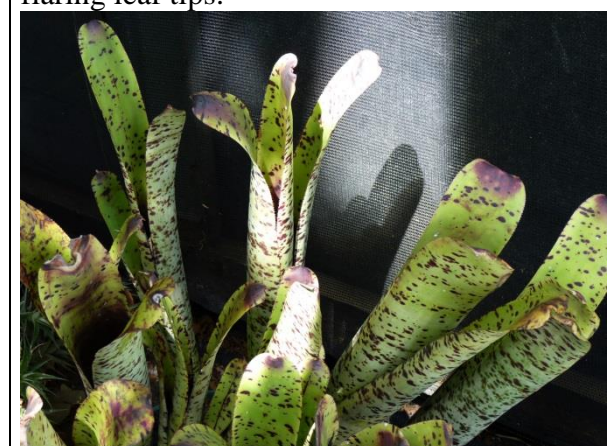
Quesnelia marmorata in California collection.

I've been asked a few times lately "what's the difference between Quesnelia marmorata and Quesnelia 'Tim Plowman', so I thought these photos might clear up any confusion. Quesnelia marmorata resembles a typical Billbergia with its tubular shape and slightly flaring leaf tips.