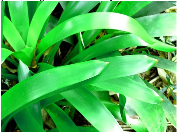
Vriesea phillipo-coburgii grown in shade – note the plain green leaves.

is dependent on proper lighting is that of color and markings. As an example of this, I've included photos of a Vriesea that I've grown in my yard for many years. Vriesea phillipo-coburgii is usually recognized by its yellowish-green leaves with dark red marking on the leaf tips, but these markings only become noticeable when the plant is grown in bright light. The first photo shows an example of an offset from this plant grown under a heavy canopy of oak trees and the second is an offset of the same original plant, but grown under nearly full sun.