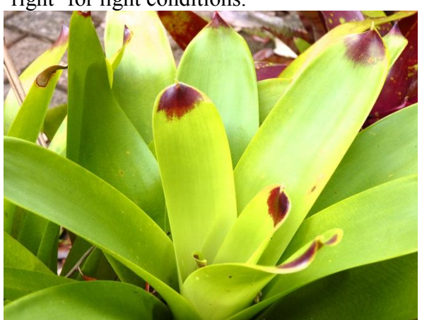
Vriesea phillipo-coburgii grown in full sun

Which plant was grown under the right light conditions? That depends on your objective, but it may be difficult to define 'right' for light conditions.