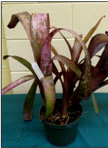
Billbergia ; Don Beadle hybrid