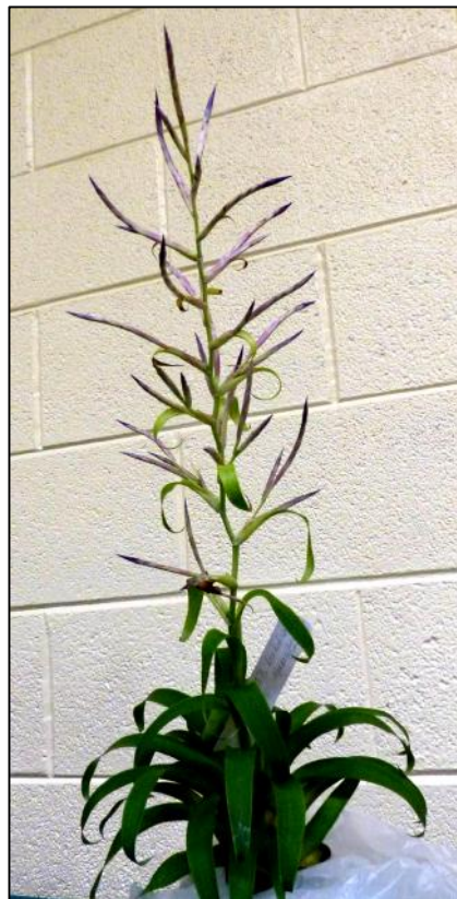
Tillandsia leiboldiana 'Mara'