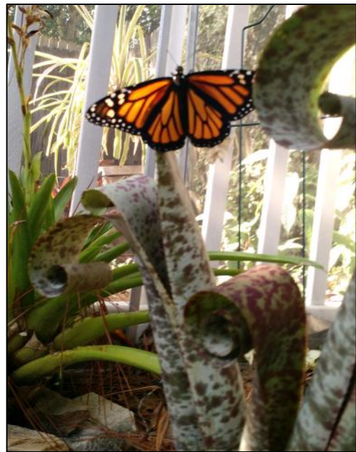
Ques. 'Tim Plowman' with a monarch butterfly newly emerged from its chrysalis attached to the plant.