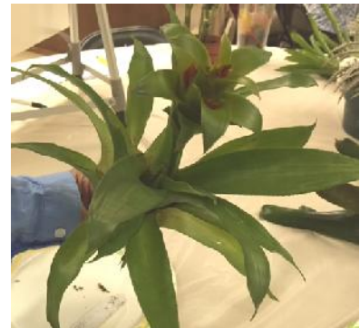
Canistropsis seidelii (with green bloom stalk)