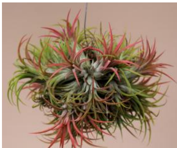
Tillandsia ionantha 'Peaches' (submitted by Gary Lund)