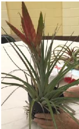
Tillandsia fasciculata 'Magnificent'