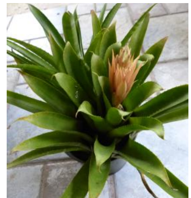
Aechmea 'Echidna' ( Aec. recurvata x chantinii )