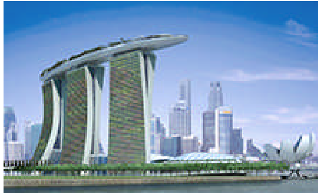
Buildings with rooftop gardens