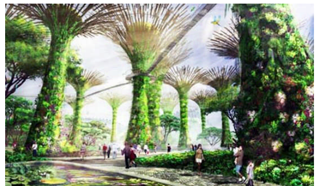
Super Trees with vertical gardens