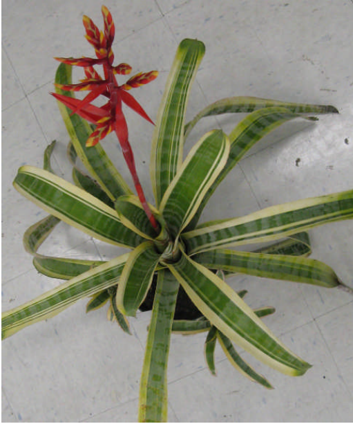
Aec. chantinii 'Shogun'