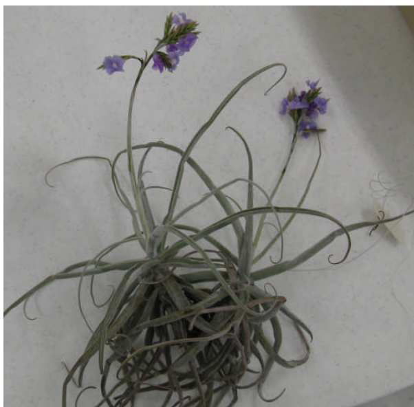
Til. streptocarpa (fragrant)

Til. 'Curly Slim'; Til. didisticha ; Til. ionantha 'Mexican Blushing Bride'; Til. 'Showtime' ( T. bulbosa x T. streptophylla ); Til. compressa ; Til. streptocarpa (fragrant); Neo. 'America'; Neo. 'Magali'