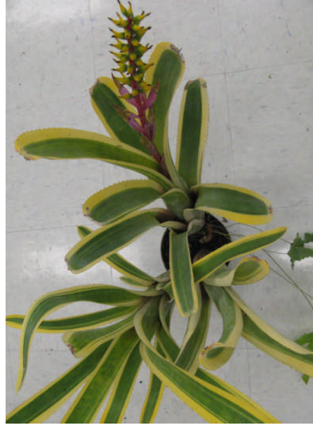
Aec. nidularium var. flavomarginata