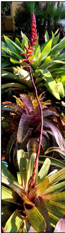
Vriesea hybrid with inflorescence and night-blooming flower