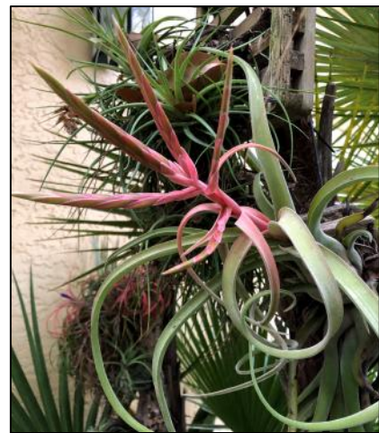
Tillandsia 'Curly Slim'