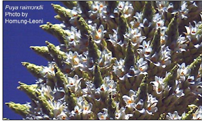
Puya raimondii flowers