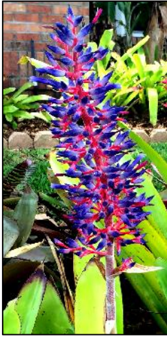
Aechmea 'Del Mar'