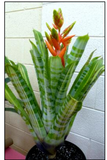
Aechmea zebrina variegated