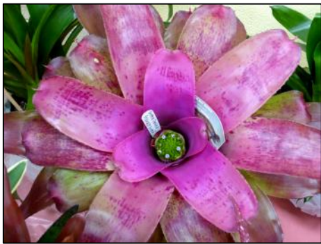
Neoregelia 'Grace Darling' x 'Princess Grace'