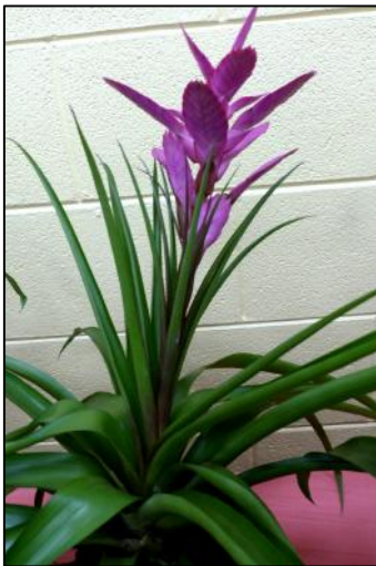
x Wallfussia 'Antonio'