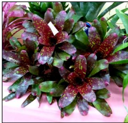
Neoregelia 'First Prize'