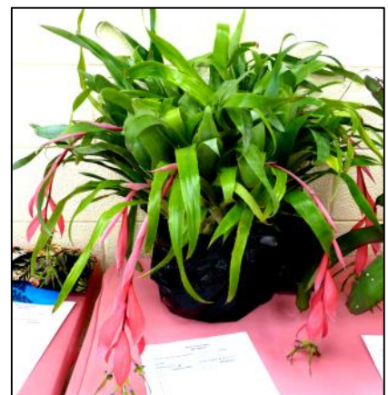
Billbergia 'Queen of Tears'