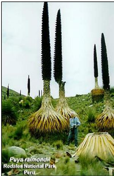
Puya raimondii