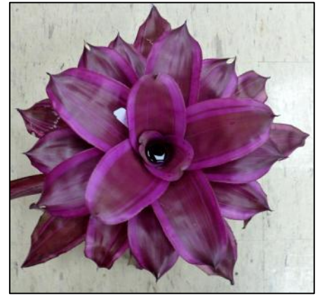
Neoregelia 'Pink Magic'