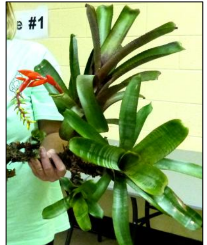
Aechmea nudicaulis 'Silver Streak'

And below are pictures of items in the silent auction.