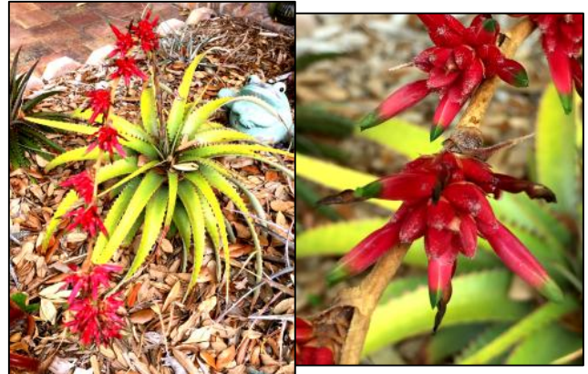
Deuterocohnia brevispicata *