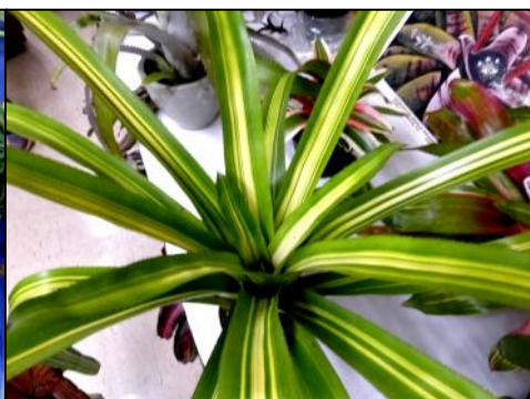
Aechmea 'Blue Tango' variegated