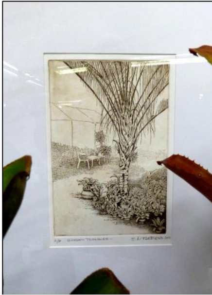
Garden Triangle , a copperplate etching by Stephen Littlefield, artist proof