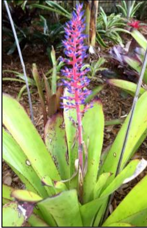
Aechmea 'Del Mar'