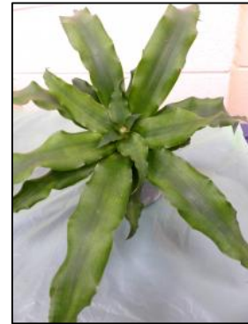
Cryptanthus 'Doug Trahan'