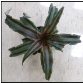
Cryptanthus 'Brown Sugar'