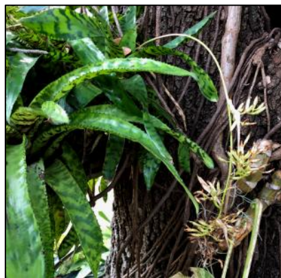
Aec. correia-araujoii , 09/2019