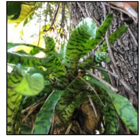
Close up, Aec. correia-araujoi

We first acquired the 'White Knight' in 2014 as a single plant, and after it produced pups we mounted all the plants on wood and hung them in the oak tree. We do not recall ever having Aec. correia-araujoi in our collection but memory fails sometimes, so maybe we did have it at one time. Even if that is the case, how did one get into the cluster hanging in the oak tree?