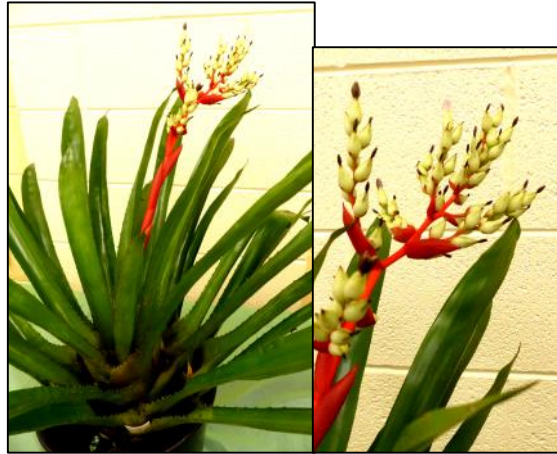
Aechmea weilbachii forma viridisepala