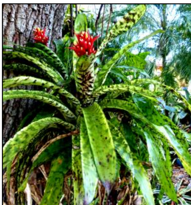
Aec. ‘White Knight’, 02/2017

We have a cluster of mounted bromeliads—four to five at a time—labeled Aechmea ‘White Knight’ x ‘Pickaninny’ that has been hanging in our oak tree for the past four years (below, on left). We were surprised last fall when one of the plants produced a bloom stalk that looked suspiciously like Aechmea correia-araujoii (below, center). The picture below on the far right shows a withered Aec. correia-araujoii stalk and a freshly blooming ‘White Knight’.