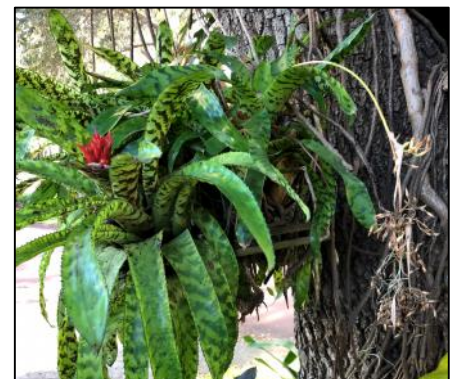
Both plants, 12/2019