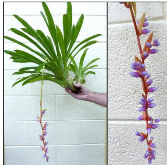
Aechmea weilbachii forma pendula