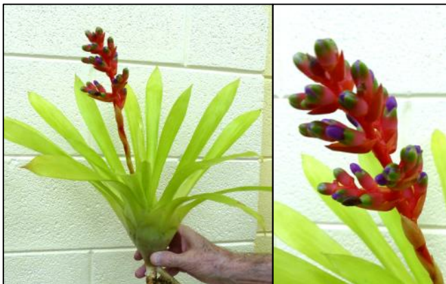
Aechmea weilbachii forma leodiensis