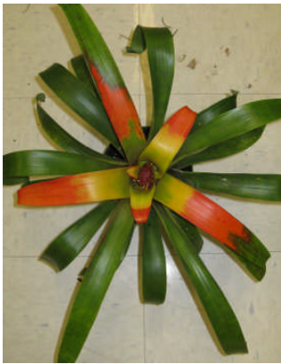
Guzmania sanguinea var. sanguinea