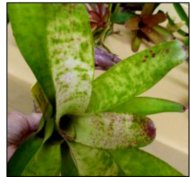
Neoregelia 'Ice White River'