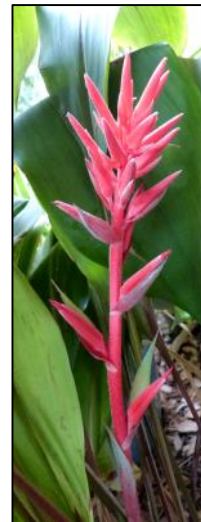
Pitcairnia sanguinea x undulata