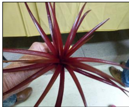
X Sincoregelia 'Firecracker'