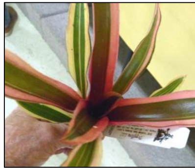
Neoregelia 'Spicy Hot'