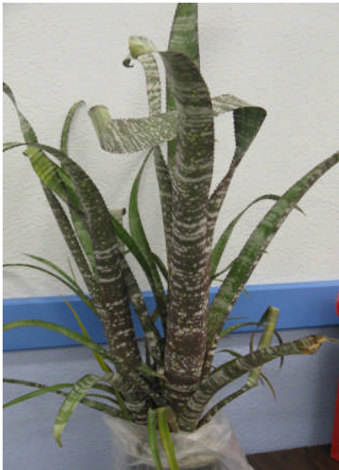
Bil. rosea (special raffle plant)