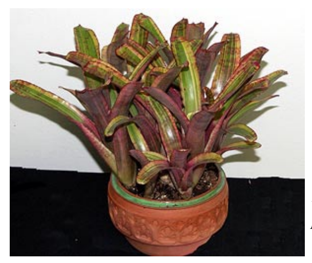
Neoregelia ampulacea 'Variegata'

Colored pencil drawing of Neoregelia pauciflora by Kiti Wenzel