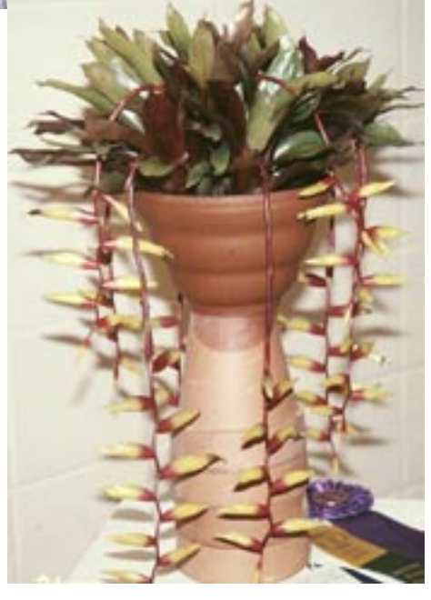
Vriesea simplex 'Rubra'