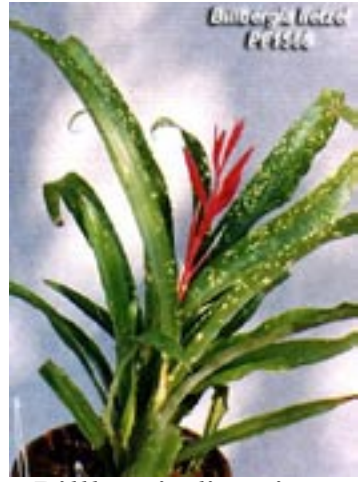
Billbergia lietzei