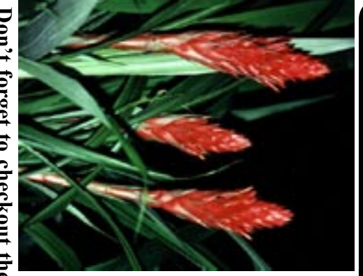
Pitcairnia 'Hattie'

Caloosahatchee Bromeliad Society 3836 Hidden Acres Circle North Fort Myers, Fl 33903