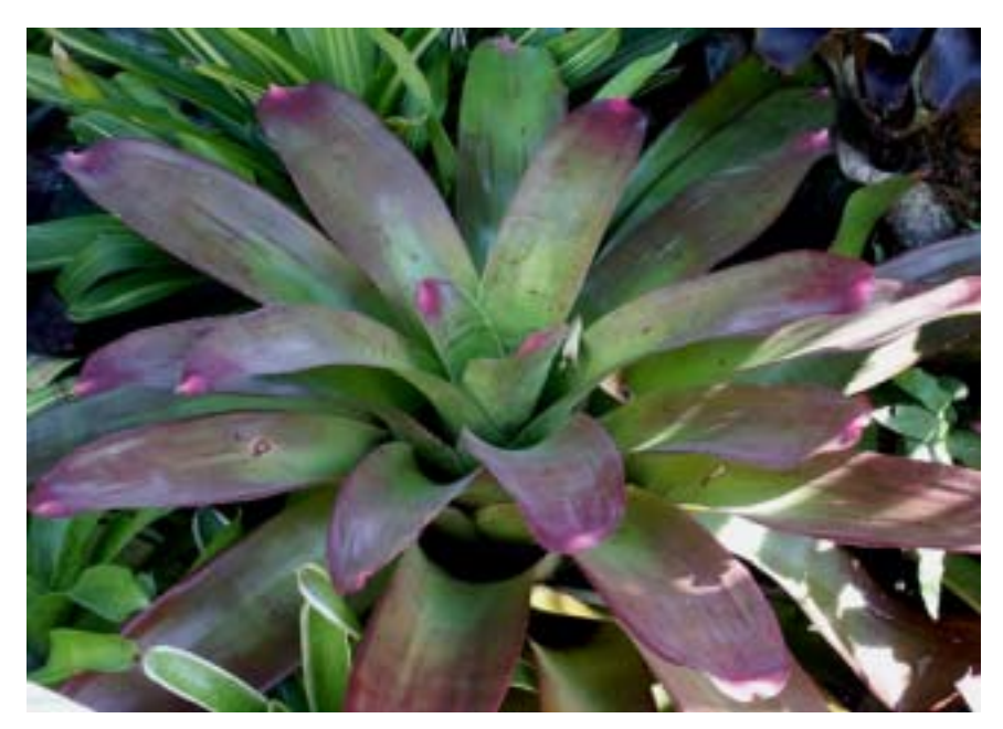
This plant was labeled Neoregelia johannis menescalii and was growing in partial shade in Fort Myers, Florida.