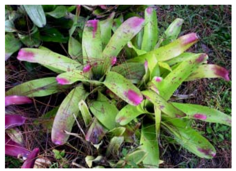
Growing in moderately full sun in a North Fort Myers, Florida yard is this more classicly colored and marked Neoregelia johannis (probably the cultivar 'Fairchild').