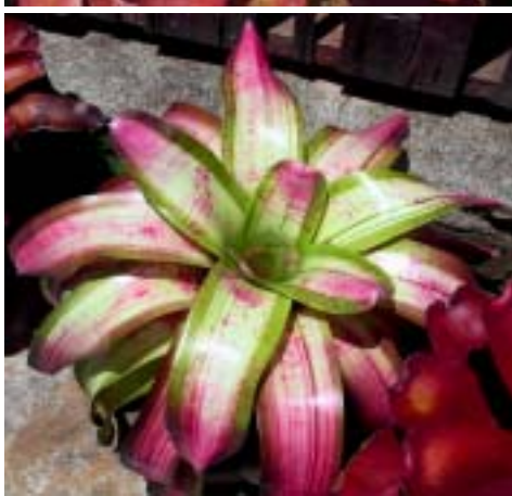
(Top photo) Neoregelia johannis growing in full sun in Honolulu Hawaii. (Lower photo) Growing directly next to above plant was Neoregelia johannis 'De Rolf'.