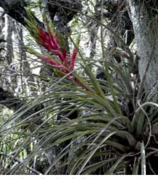
(Left) Tillandsia balbisiana and (right) Tillandsia fasciculata growing at the Fakahatchee Preserve in South Florida.

We have a perfect example of introgressive hybridization between bromeliads in southern Florida. Tillandsia balbisiana and Tillandsia fasciculata form hybrid swarms in