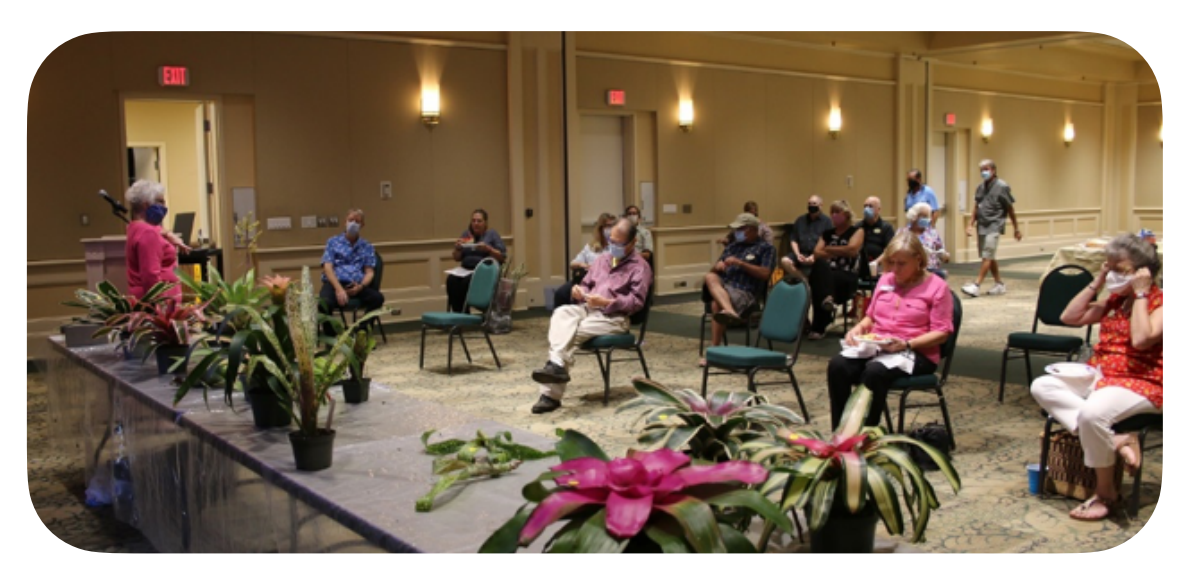
A socially distanced event.