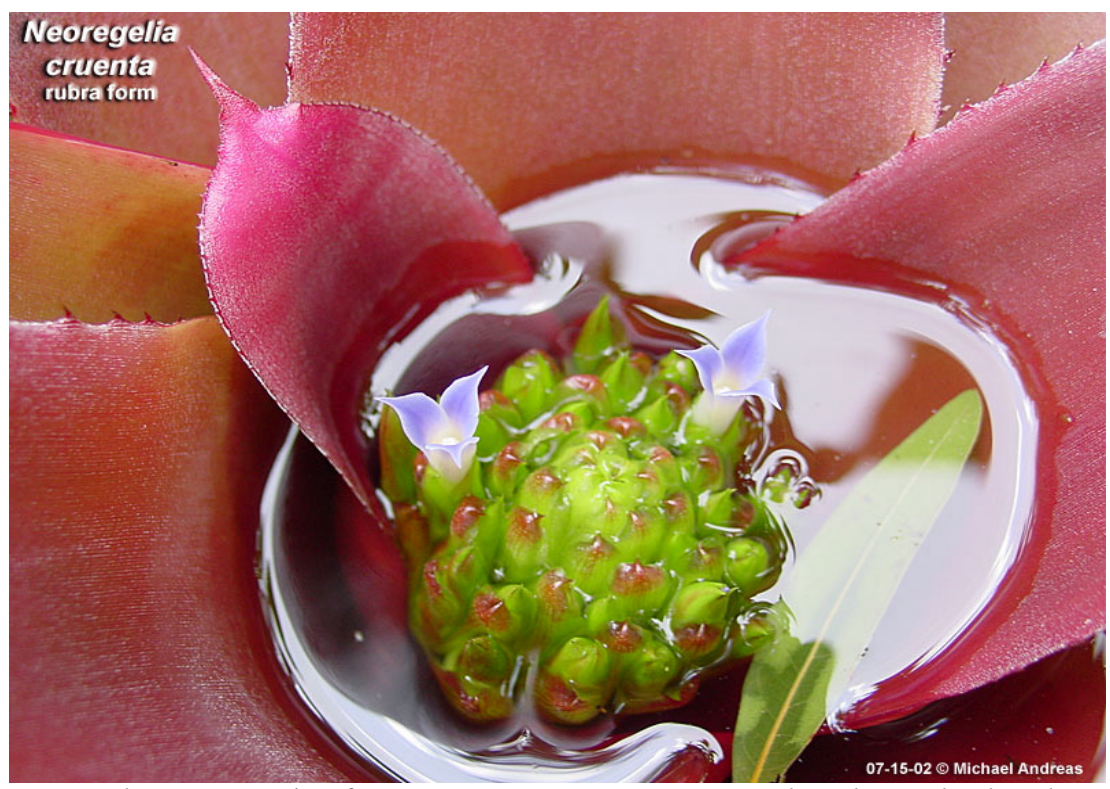
Neoregelia cruenta rubra form

Pests and problems in Neoregelias are limited to scale, both white soft body scale and black flyspeck scale. Treat with Safer soap and make sure that the Neoregelias are given ample room to grow. Overlapping leaves and areas with poor air circulation create opportunity for scale.