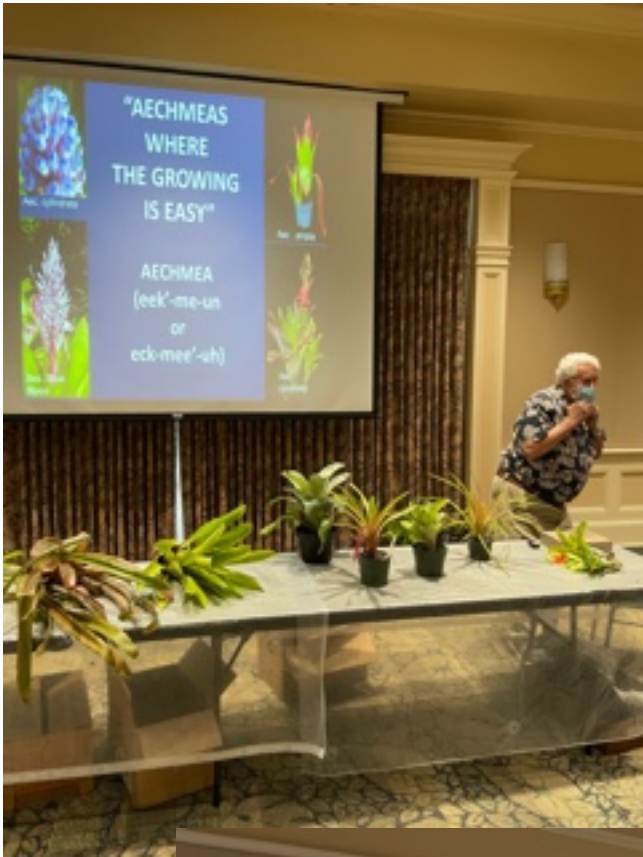
March meeting, house tours and Leu Gardens...