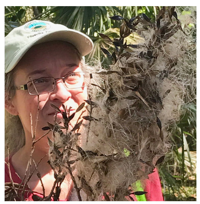
Earlier in the day, burlap covered frames were prepared to hang in the forest once covered in Tillandsia seeds. Numerous methods have been tried for germinating the seeds, vertical hanging methods have seemed to work the best.