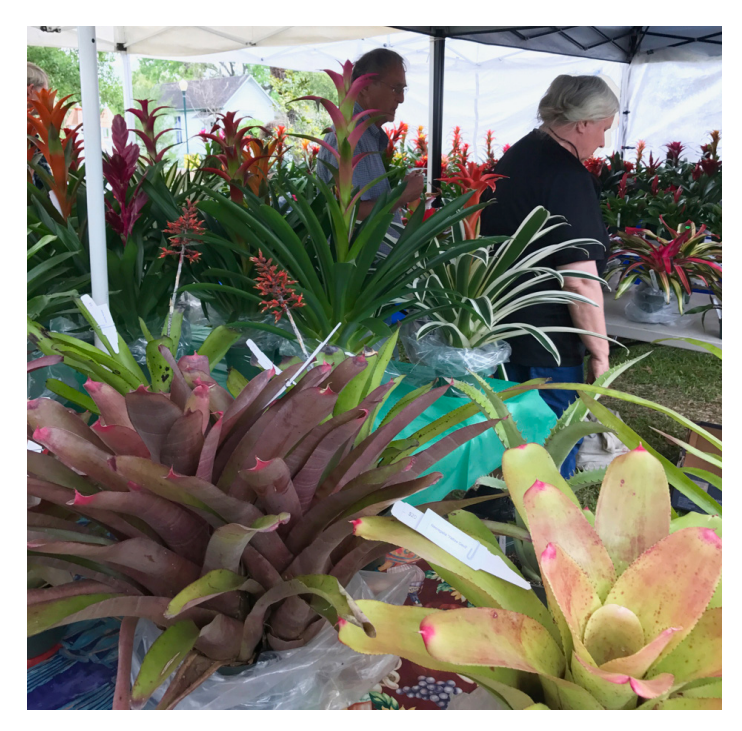
We had a great turn out! A bit more sun this year thanks to Hurricane Irma damage at the Garden, but some quick tent organization kept everyone cool.