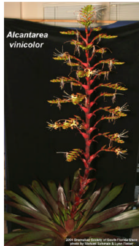
A. vinicolor.