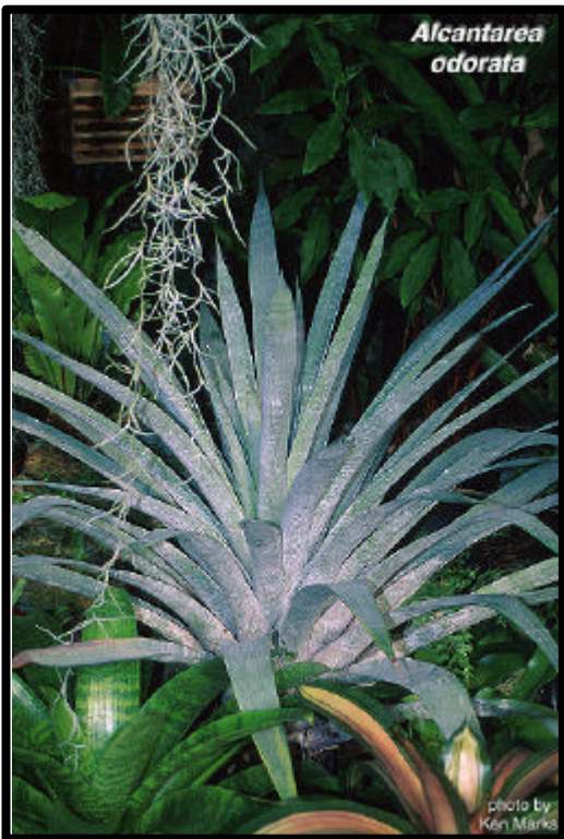
A. odorata.

"Several large species available for cultivation are cold-tolerant, easy to grow, and spectacular (e.g., A. imperialis , A. odorata , A. extensa , A. brasiliiana , A. vinicolor , and A. heloisae )."