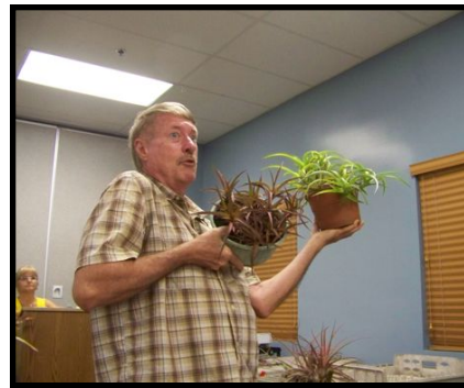
Cryptanthus Bahianus Red and Green