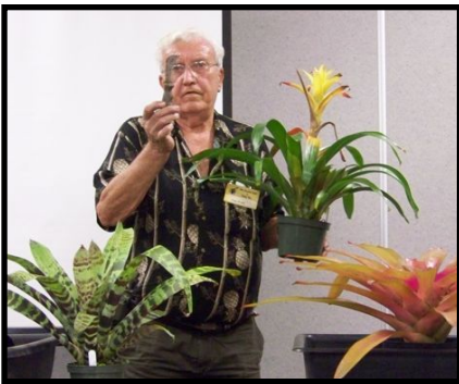
Workshop by Tom