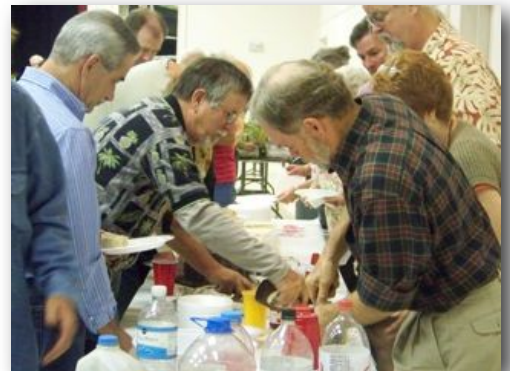
Time to Eat!