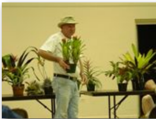
Show & Tell