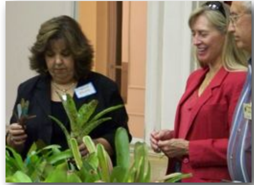
Should I get this one or that one?