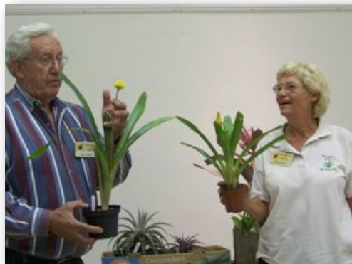
Compare & Contrast