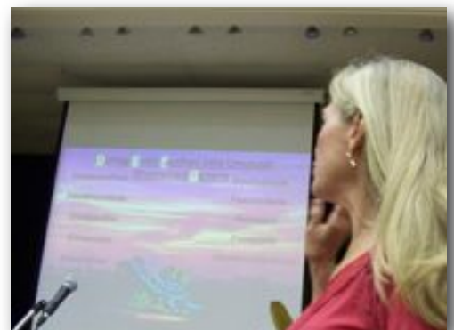
Program: Diving Even Further . . .