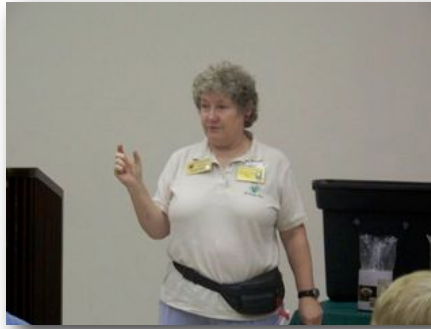
Harriet's Workshop on Vermiculture