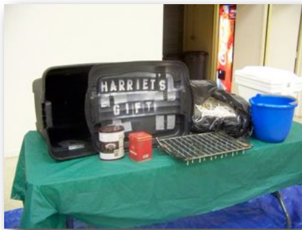
Harriet's Raffle Gift