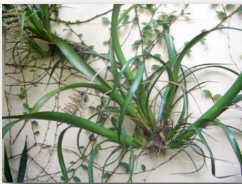
Bromeliads at Sunken Gardens