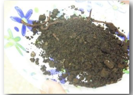
Please pass the worms.