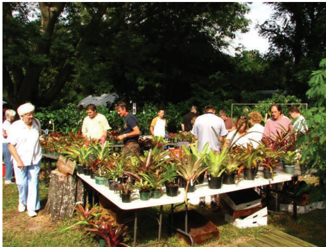
USF FALL SALES BOOTH