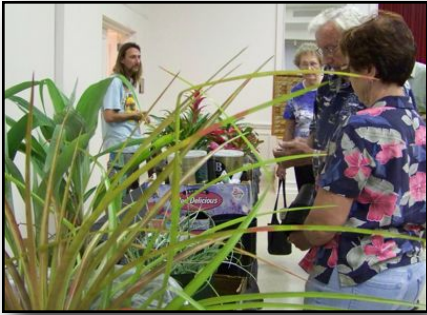
Pre-meeting Plant Sales