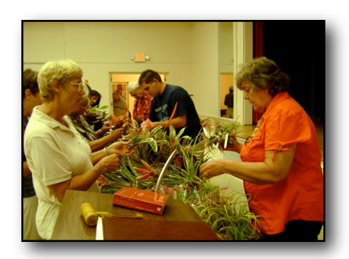
Pre-meeting Plant Sales