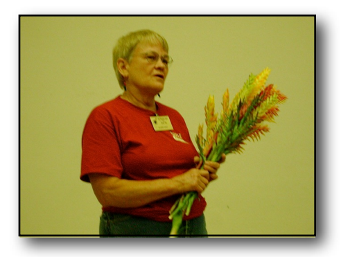
Materials for Arrangements