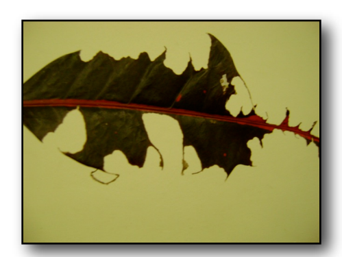
Damage by Lyla's Pet