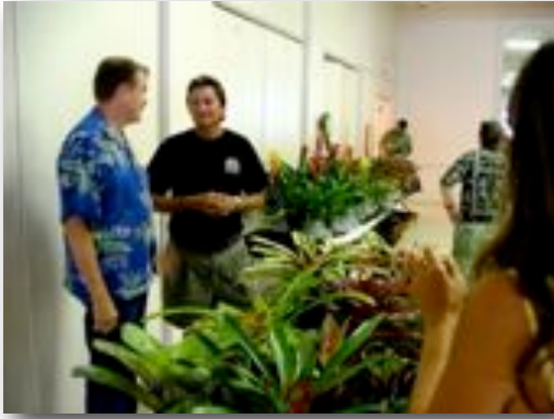
Sales and Conversations