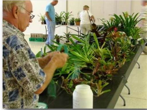
I wonder how many raffle tickets I can sell ...