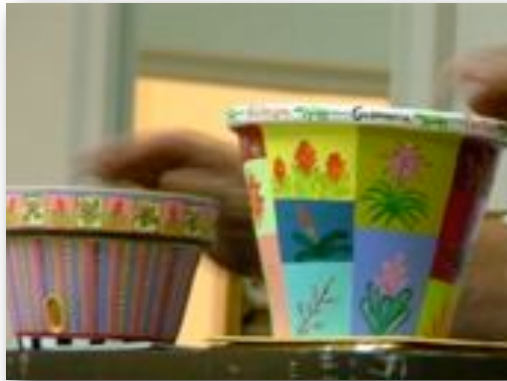
Extravaganza Raffle Items