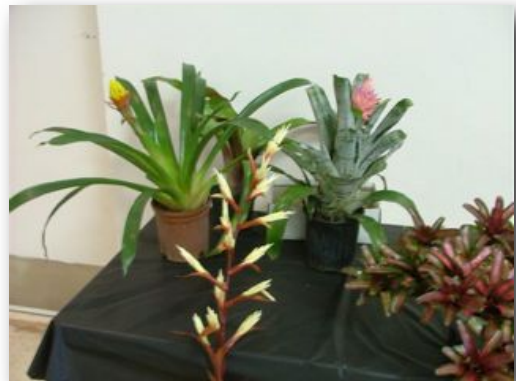
Show and Tell