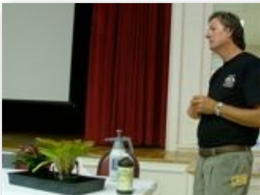
Workshop on Forced Blooming