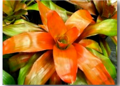
Neo 'Tangerine' by Grant Groves is a shade plant.