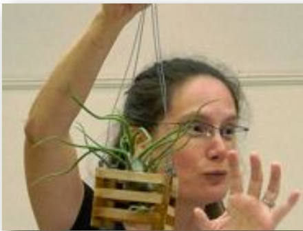
Show & Tell - Till bulbosa