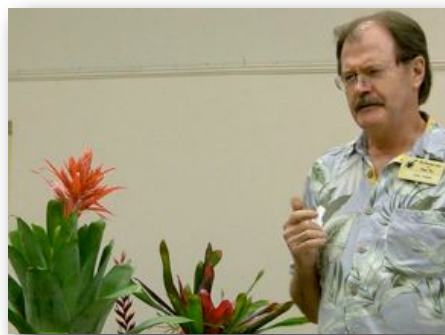
Show & Tell