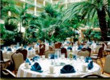
Sheraton Suites Tampa Airport

If you would like to place an ad in our Extravaganza program for your business, your society, or a personal note, the price is as follows: