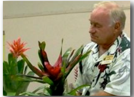
Did you ever see one this wierd?