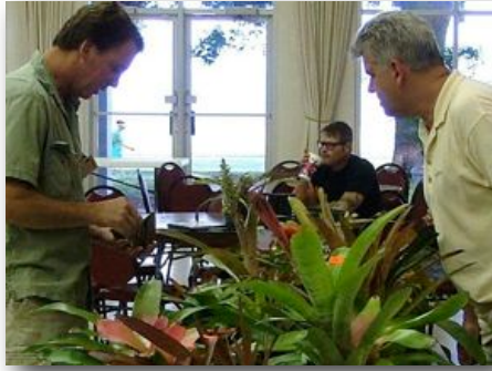
Now let's see, I NEED this one.