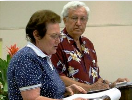
June Treasurer's Report