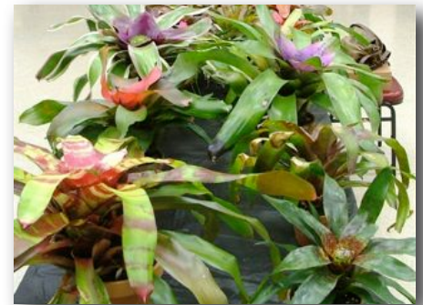
Neos Jim Stewart used in program on Neo color