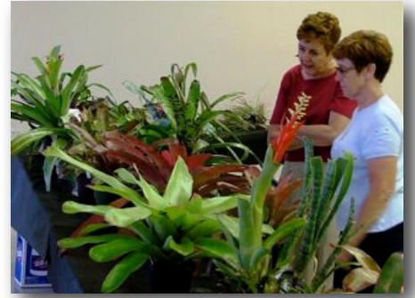
I'm going to bid on this one.