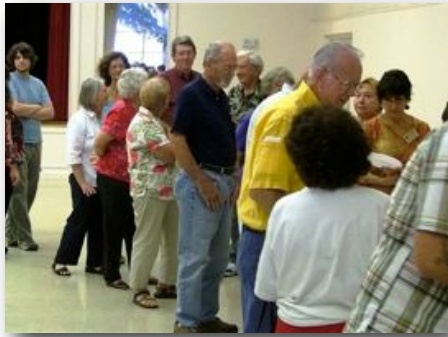
Hey, leave some for us back here.