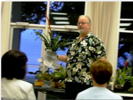
Now for the auction