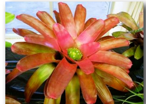
Neo Morrisana Australian