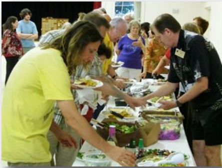
By golly, this looks good!