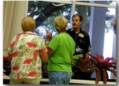
Now, you ladies need to bid on these.