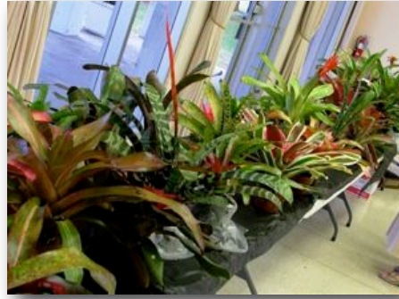
Auction Table 2