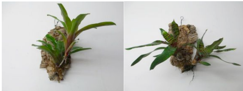
Bromeliads mounted to cork

Cork is used in woodwind instruments to fasten together seams, making them airtight; cork is the core of a baseball, used in spacecraft heat shields, inside footwear to improve climate control, floor tiles, fishing (rod) floats and buoys, handles for fishing rods. Cork is an excellent mounting medium for bromeliads, but in our tropics it is also a popular home for grubs that eat the roots of the plants.