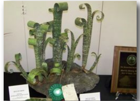
Best of Show Barbara Easton