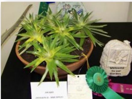
Division Winner Multiples Foliage