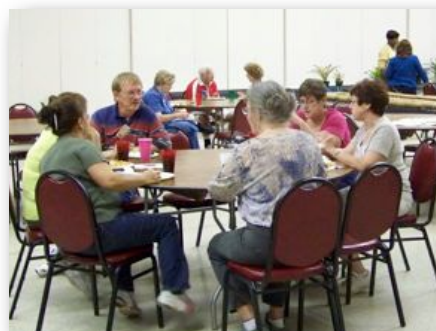
April Meeting Refreshment Time