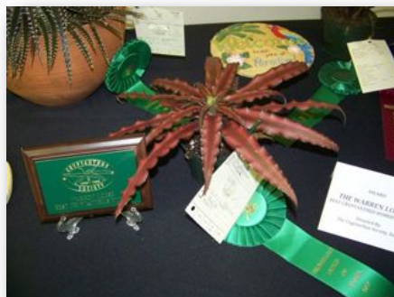
Best Cryptanthus Hybrid