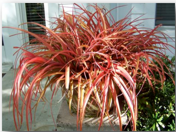
Harry P. Leu Gardens, Orlando