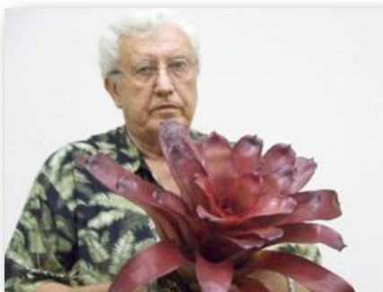
April Meeting Show & Tell