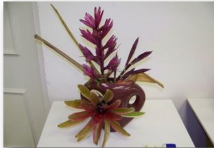
Artistic Design by Eileen Prins