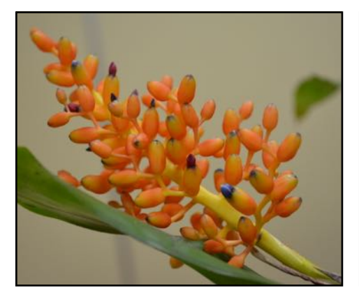
Aec capixabae