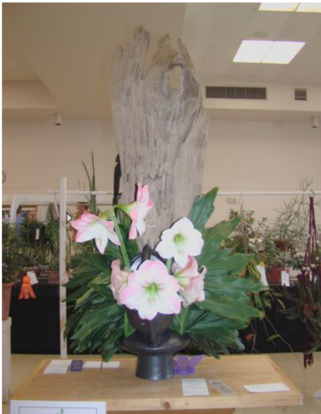
2 Sided Designs: Egypt by Kay Miller