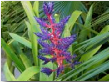
Aechmea Blue Tango