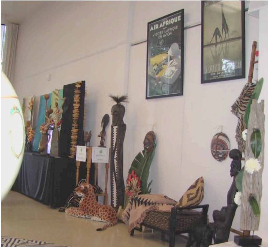
"IT'S A BEAUTIFUL WORLD"