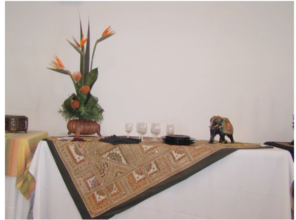
Beautifully set table with arrangement and African theme.