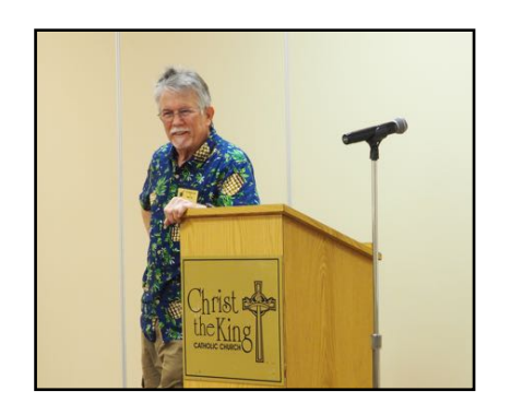
Call to Order