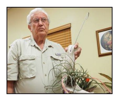
Tom Wolfe - Till. baileyi