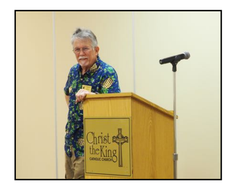
Call to Order