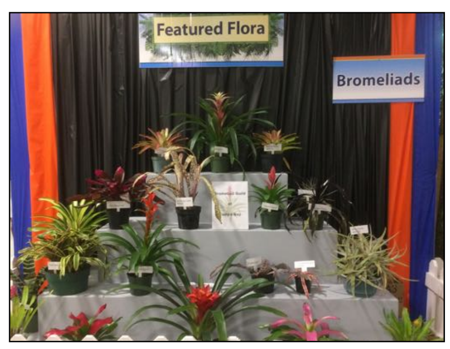
Bromeliads were featured in the Horticultural Area of the Florida State Fair this year.