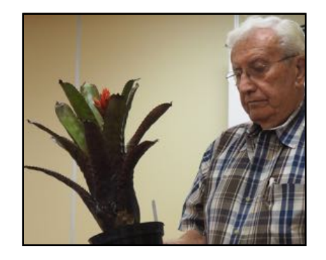
Quesnelia Black Knight