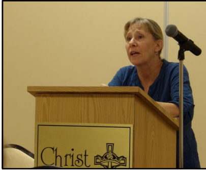
Call to Order