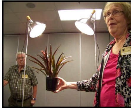
Dottie's Show & Tell