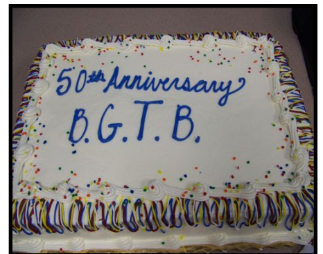
We Celebrate 50 Years!