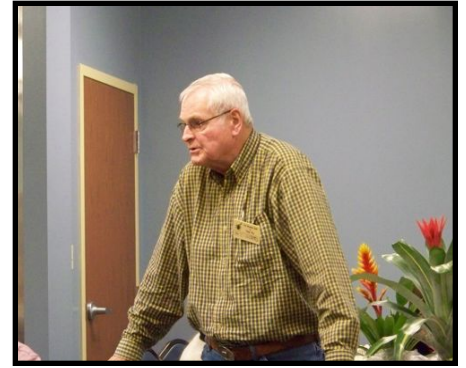
Report from FCBS