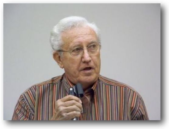
Where's the Mic?