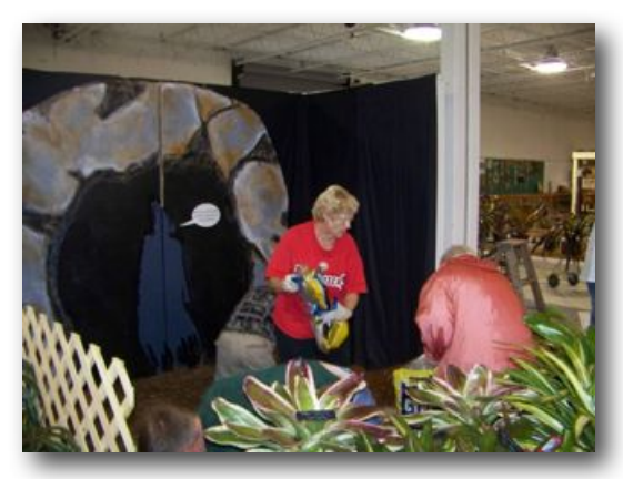
Working on Our State Fair Exhibit