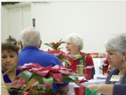
Good Food and Conversation