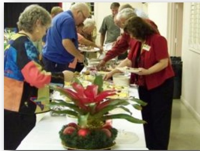
Time for the Feast!