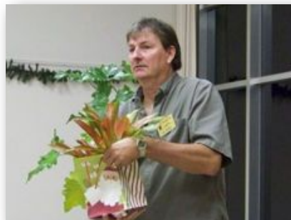
Let's Start the Bidding