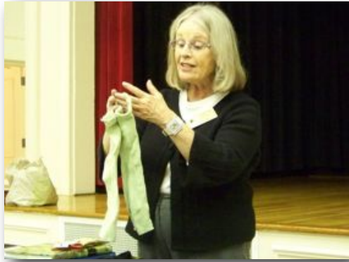
Eileen's Helpful Tips