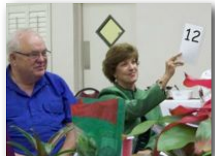
Sold to Number 12!