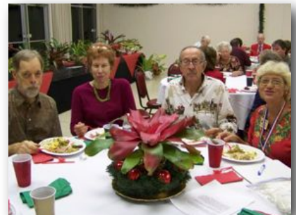
What a Foursome!