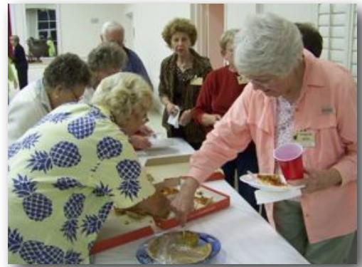
Time to Eat!