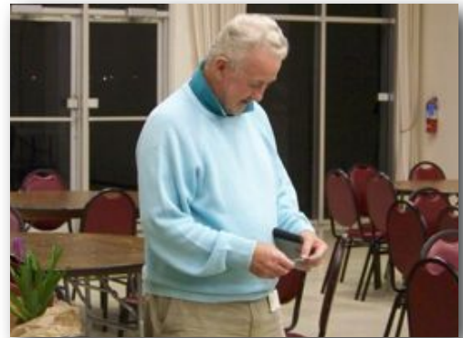
Did She Call My Number?