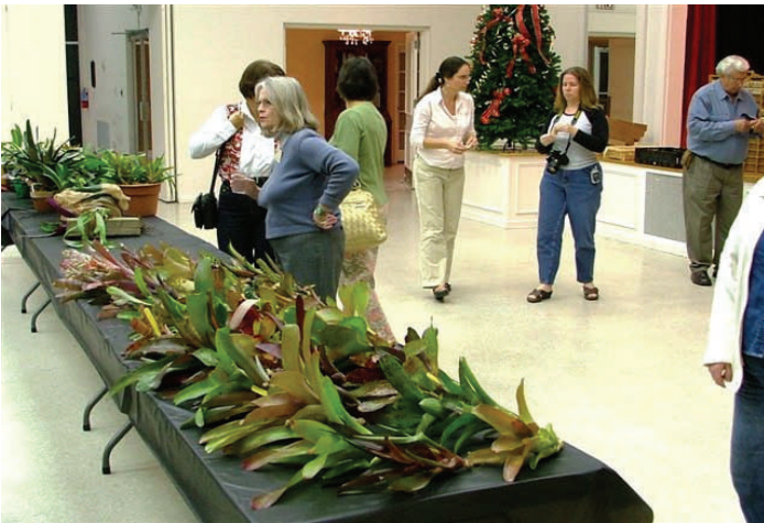
GIVE AWAY PLANTS