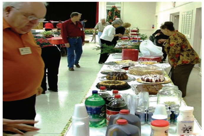
OF COURSE DESSERT TIME