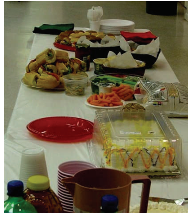
Refreshments for all