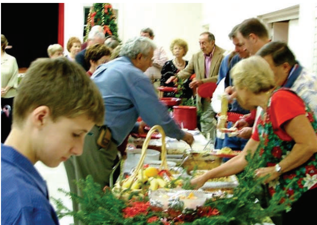
AFTER THANKS WE ENJOYED A GREAT DINNER