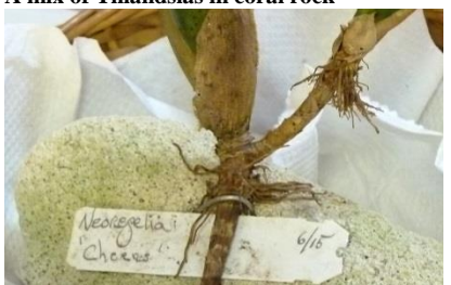
Neoregelia 'Cheers' shows good root attachment