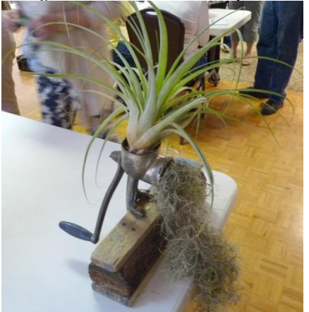
Tillandsia utriculata goes into the grinder and out comes Tillandsia usneoides!