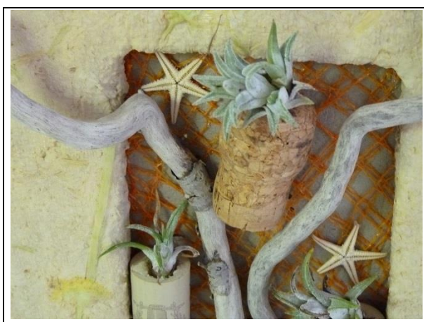
\boldsymbol{A} beautiful seascape – treasures from the sea combined with small Tillandsias