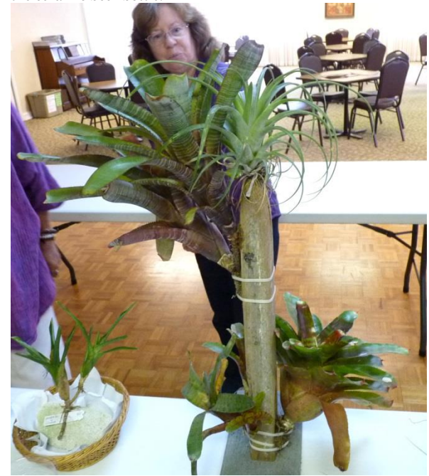
Multiple plants are attached to this piece of driftwood