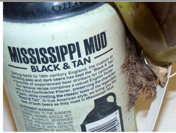
A close-up shows that these Neoregelias are firmly attached to the ceramic beer bottle.