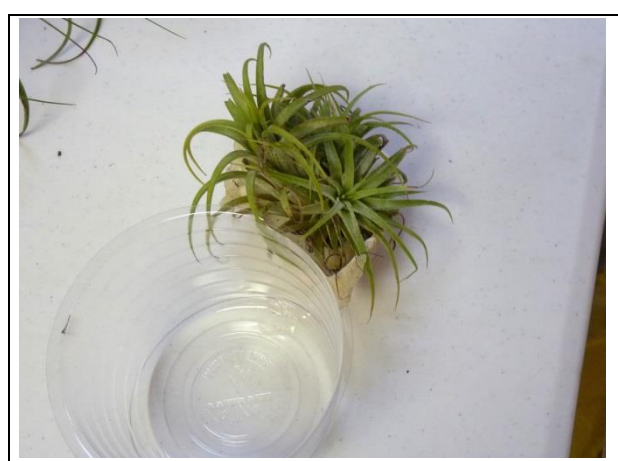
The smallest entry? Tillandsia ionantha