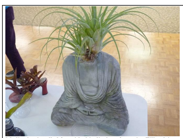
Meditation is called for with this display of a native Tillandsia.