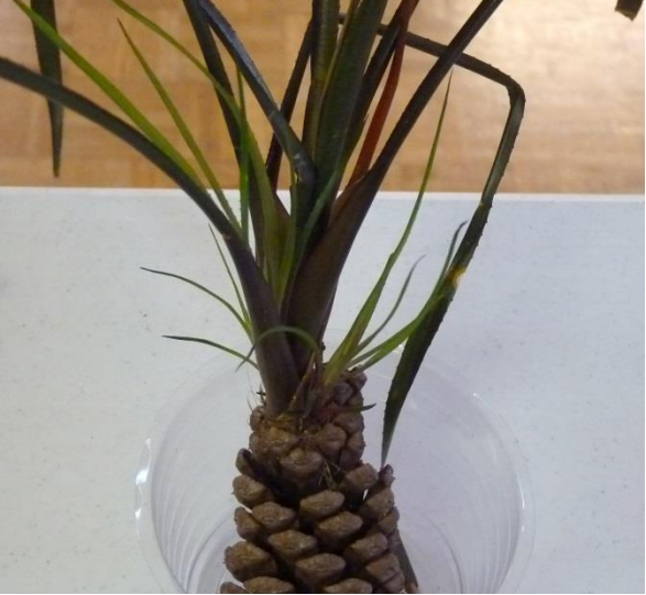
Who would have thought to attach a bromeliad to a pinecone?