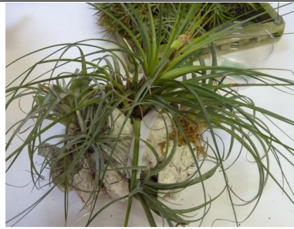
A mix of Tillandsias in coral rock