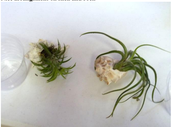
Perhaps the smallest of the small entries?