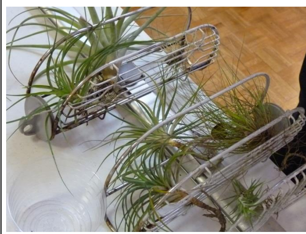
New use for an old shower caddy