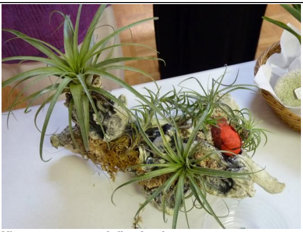
Nice arrangement on shell and rock