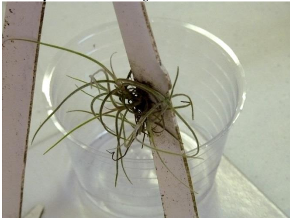
On the leg of the bird...Tillandsia recurvata has been firmly rooted!