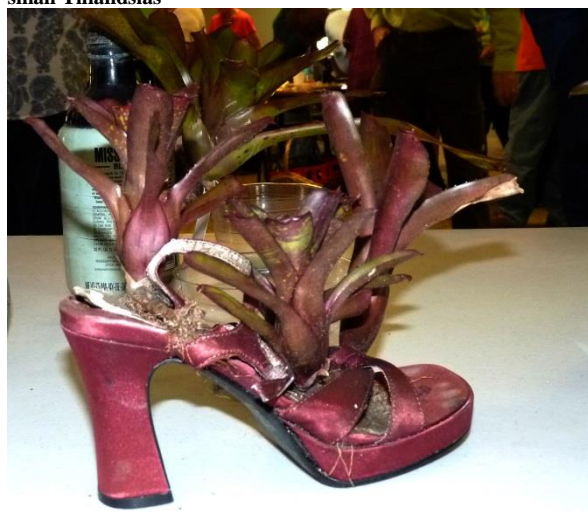
"There was an old woman who live in a shoe..."