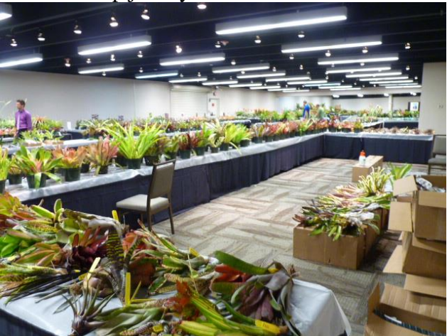
That's a lot of bromeliads!!!

And, there is always a fabulous plant sale – worth the trip just by itself!