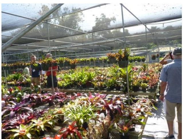
Jimbo's bromeliad nursery outside of Houston

And, there is always a fabulous plant sale – worth the trip just by itself!