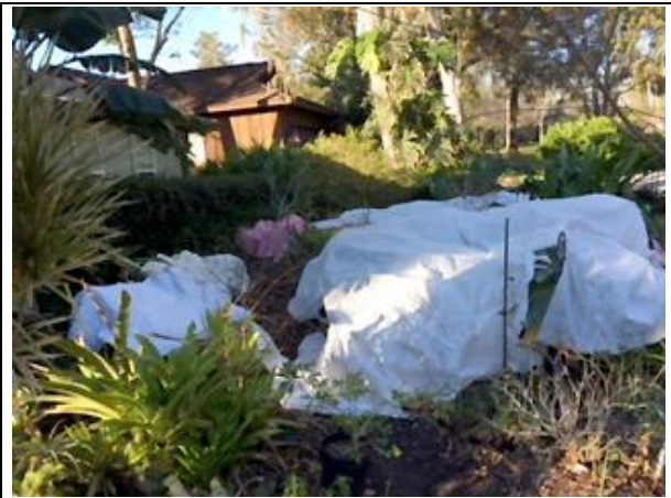
The larger plants in the landscape wouldn't fit in the garage – and that's where frost cloth was used to cover plants in the yard.