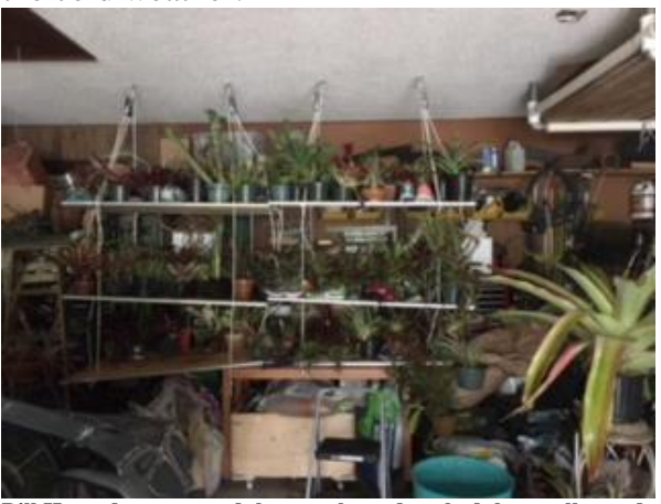
Bill Hazard constructed these racks and packed the smaller and more cold sensitive plants into his garage.

Well, I think it's safe to say that the worst of the cold weather is behind us now. What did you do to protect your plants when the temperatures dropped below freezing this year? Bill Hazard shared these photos of his efforts to minimize the damage from those nights of low temperatures. His approach was in 3 steps: Those smaller and most coldsensitive varieties in pots were moved to the garage. The larger plants in the landscape that were also cold-sensitive he covered with frost cloth. Finally, those in the landscape that were more cold tolerant were left to prove just how cold-tolerant they really were. They were not covered and bore the brunt of the cold weather.