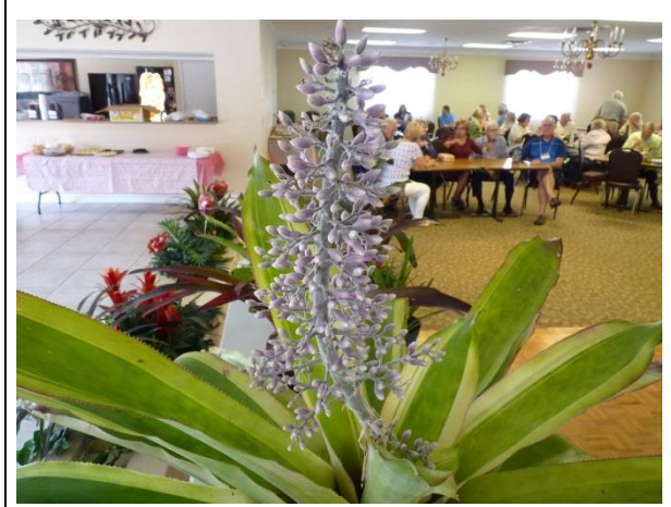
Bill Hazard's Ae. mexicana may have had some cold damage, but isn't this a great bloom!

The Aechmeas are a very diverse and attractive bromeliad group, but are not especially well suited for the landscape in our east-central Florida area. Many of the more desirable varieties like Ae. Mexicana (shown above) or the ever popular Ae. blanchettiana simply can't tolerate the few days of extreme low temperatures that we may experience each winter. That's not to say that you absolutely can't grow these plants in your landscape settings – it simply means that unless you provide some appropriate means of cold protection many of the popular Aechmea varieties either will not survive our winters or, perhaps worse - they may survive, but their cold damaged leaves will provide a continual reminder for many months after the warm weather returns that Aechmeas are not