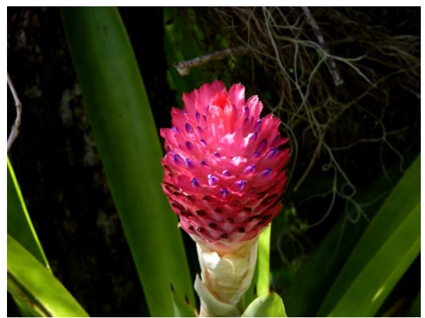
If you are making a list of cold-hardy plants, make sure that Quesnelia testudo is on it!

It's also time to get busy and work in the garden. No more lazing around the house, watching daytime TV, eating chocolate bonbons and drinking diet cokes it's time to get out there and go to work! You might want to start by removing and potting up those pups that have been growing on your Neoregelias since last fall. The ones that are on stolons are probably the easiest to remove, so start there. Just take your shears and snip the stolon near the base of the pup. Put your new pup in a pot with some potting mix. Put a new tag identifying your pup in the pot and you're done. Now, how easy was that? The pups that are not on stoloniferous plants are probably held closely to the base of the parent plant and might be a little more difficult to get to. Try removing the parent and pup from your old pot and washing the potting mix off the roots of the parent. You can also remove the old, dead leaves from the base of the