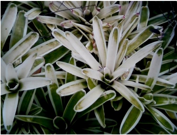
...but where they were located in the yard made quite a difference. This group of the same variety of Neoregelia, but in a more exposed location shows the characteristic bleached-out effect of too much cold.