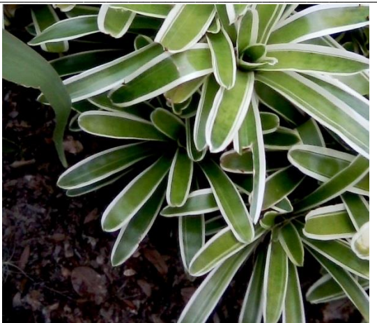
Many of the Neoregelia varieties like these are quite cold-hardy and survived with little or no damage.