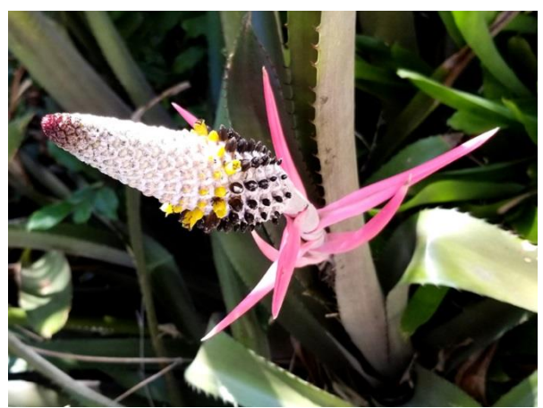
This is the time of year for Aechmea bromeliafolia to show its stuff and this is a great example of the bloom. The showy yellow flowers don't last long and this is what you see: white buds that haven't opened, yellow flowers, and black spent blossoms.