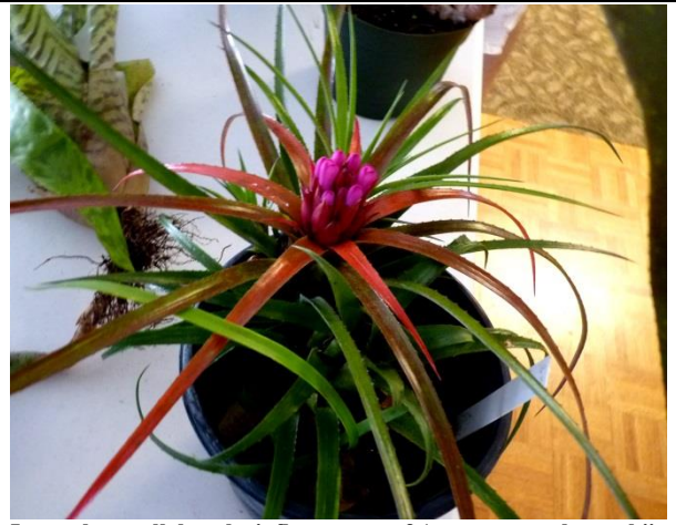
It may be small, but the inflorescence of Ae. recurvata benrathii is sure to grab your attention.