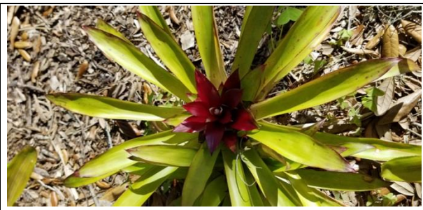
Guzmania hybrids are not usually known for their coldhardiness, but those that have Guzmania lingulata minor in the parentage tend to be the exception as this plant in Virginia's landscape demonstrates!