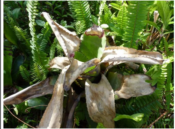
Severe cold damage on a Neoregelia carcharodon hybrid.

A good plan and a very reasonable approach. I'm sure that the damage to Bill's plants would have been much worse if he hadn't taken these measures of protection. Now it's time to survey the damage this past Winter's cold weather may have caused to our bromeliads.