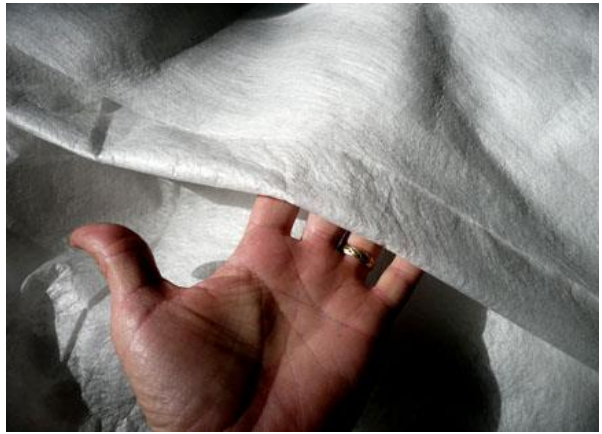
Frost cloth can be used year after year and provides 3-5 degrees of protection by trapping and retaining residual ground heat.

A good plan and a very reasonable approach. I'm sure that the damage to Bill's plants would have been much worse if he hadn't taken these measures of protection. Now it's time to survey the damage this past Winter's cold weather may have caused to our bromeliads.