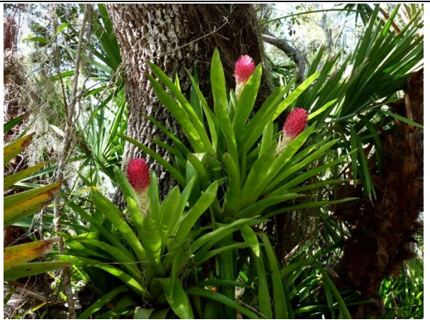
Quesnelia testudo climbs a tree several feet away from the previous Neo. photo. No damage from cold.