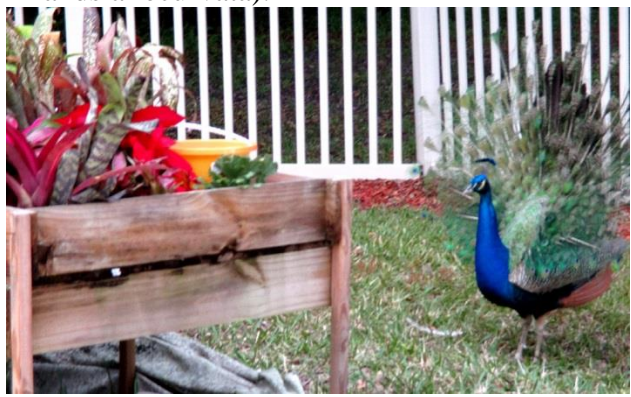
A visitor to Bill's bromeliad garden.

I have impressed both staff and residents with my knowledge of plants in general and especially bromeliads. I'm sure you wouldn't be surprised at how many people were shocked to find out they had bromeliads in and around their garden/yard - imagine their surprise to learn that Spanish moss and air plants were really bromeliads! (Tillandsia usnioides and Tilandsia recurvata).